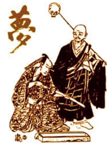
Takuan Sōhō with samurai disciple

Unlike Shaku, Sawaki Kōdō (1880-1965) was a Zen priest who actually fought in the Russo-Japanese War. As noted above, this is not surprising inasmuch as Zen monks of military age were treated as any other draft-age Japanese male. After some initial failed attempts, Sawaki took his vows as a Sōtō Zen priest at age eighteen followed by two years of Zen training. At the age of 21, however, he enlisted in the Imperial Army where he served in the Thirty-third