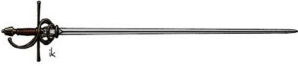
European "long sword"

It should also be noted that the Japanese military had long believed, dating from their victory in the Russo-Japanese War, that they could emerge victorious over a militarily superior (in terms of industrial capacity and weaponry) opponent. In this view, victory over a superior Western opponent, let alone China, was possible exactly because of the willingness of Japanese soldiers to die selflessly and unhesitatingly in battle. By contrast, the soldiers of other countries were seen as desiring nothing so much as to return home alive, thereby weakening their fighting spirit. Suzuki's words could not have but lent credence to the Japanese military's (over)confidence.