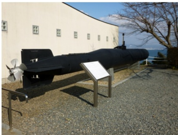
Kaiten (manned torpedo)

If only in hindsight, in reading words like these, it is difficult not to be reminded of the infamous and tactically futile "banzai charges" of the wartime Imperial Army let alone the tactics of kamikaze pilots and the manned torpedoes ( kaiten ) of the Imperial Navy.