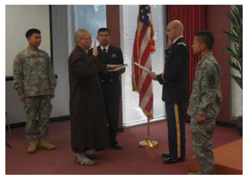
Swearing in Ceremony for an Asian Buddhist U.S. Army Chaplain

Note: The phrase in brackets need not be said if the speaker has a personal or moral objection.