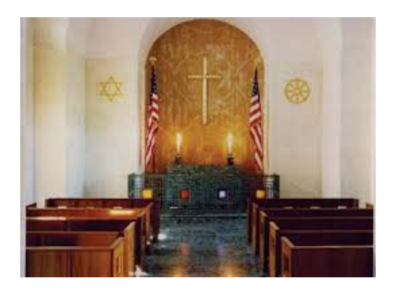
Chapel at the Punchbowl in Honolulu, Hawaii

Finally in 1990 the American military resolved to make plans for inclusion of Buddhists chaplains in the armed forces. In August of that year the Institute of Heraldry produced rank insignia, once again taking the Dharma Wheel or dharmachakra as its emblem.