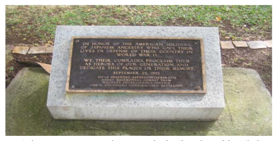
A plaque commemorating the wartime deaths of members of the 442nd Regimental Combat Team

Needless to say, many if not the majority of these Japanese-American soldiers were Buddhists, primarily associated with the Jōdo Shin (True Pure Land) sect of Buddhism. There is one indication that one or more Japanese-American Jōdo Shin priests disguised themselves as Christian military chaplains and accompanied the 442<sup>nd</sup> into battle.<sup>25</sup>