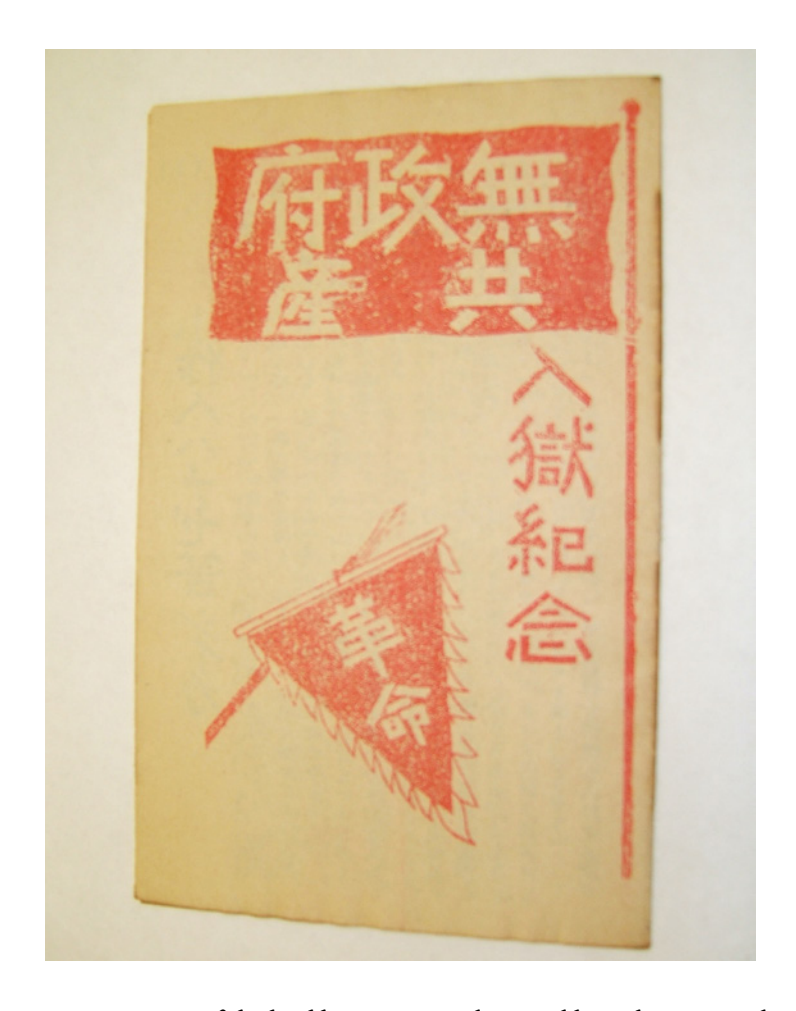
FIGURE 4: Cover of the booklet written and printed by Uchiyama Gudō. The five horizontal characters in two lines at the top of the pamphlet cover read: "Anarcho-Communism". The four Chinese characters on the right-hand side read: "In Commemoration of Imprisonment". The two characters on the pennant read, "Revolution"