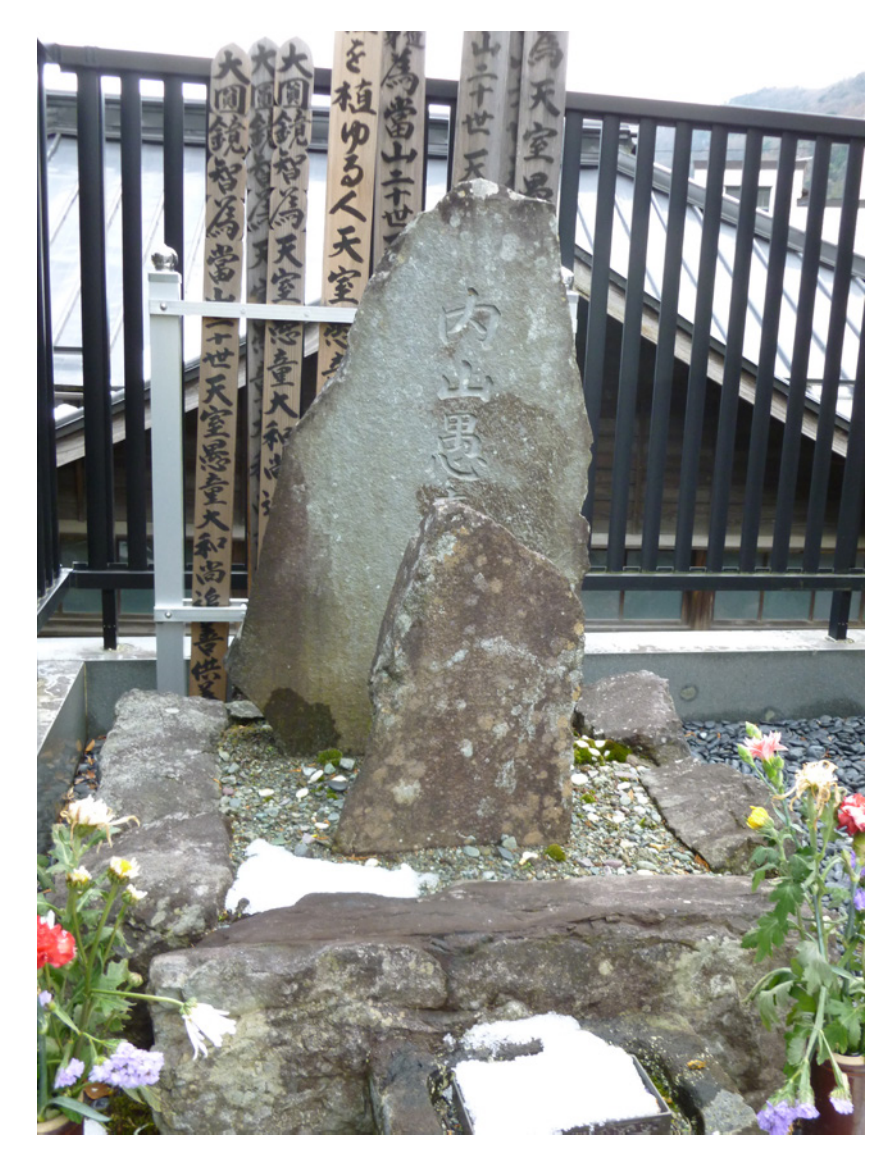
FIGURE 5: The small, uncarved, triangular stone in the foreground that originally served as Uchiyama Gudō's one and only grave marker