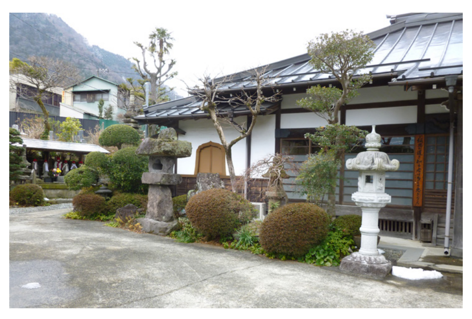
FIGURE 3: Uchiyama Gudō's temple of Rinsenji as it appears today, with a metal roof instead of the original thatched roof

The temple Gudō acceded to was, even by the standards of that day, exceedingly humble. For one thing, it was located in a small village in the Hakone mountains southwest of Tokyo in Kanagawa Prefecture. With little land suitable for cultivation, there were only forty impoverished peasant families available to provide financial support. Aside from a small, thatched-roof Buddha Hall, the temple's main assets were a single persimmon and chestnut tree located on the temple grounds [FIG. 3]. Village tradition states that every autumn Gudō invited villagers to the temple to divide the harvest from these trees equally among themselves.