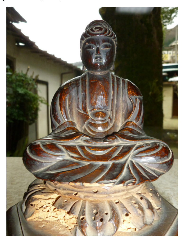
FIGURE 2: One of the few remaining statues of Buddha Śākyamuni that Uchiyama Gudō carved as gifts for his impoverished parishioners (Photo © Brian Victoria)

he gave to his parishioners. Even today these simple yet serene nine-inch-tall (c. 23 cm) carvings of Buddha Śākyamuni are highly valued by the descendants of his parishioners [ FIG. 2 ].