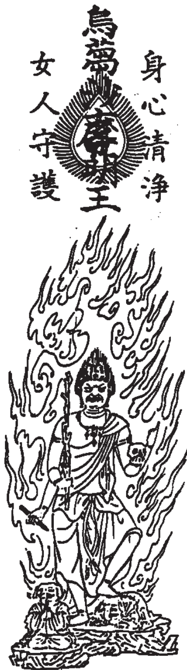
Figure 4. Talisman to ward off “female pollution.”

mental Buddhist principles. Charms formerly issued by Sōtō temples to counter “female pollution” have been banned (see figure 4). Ritual prayers on behalf of aborted fetuses ( mizuko ), the ruler (i.e., tennō 天皇), and “the spirits of the glorious war heroes” ( eirei 英靈) have been publicly repudiated. In 1993 the former Sōtō monk Uchiyama Gudō (1878–1911), who had been stripped of clerical status and executed for his anti-imperial propaganda, was officially rehabilitated (i.e., readmitted to clerical status). In 1992 the Sōtō Headquarters published an official acknowledgment of guilt for its role in supporting military conquest and an apology for the activities of Sōtō missionaries in occupied territories, especially Korea. Major Sōtō temples now perform annual memorial rites on behalf of the victims of Sōtō religious discrimination and Japanese military aggression (SŌTŌSHŪ JINKEN YŌGO SUISHIN HONBU 1994a).