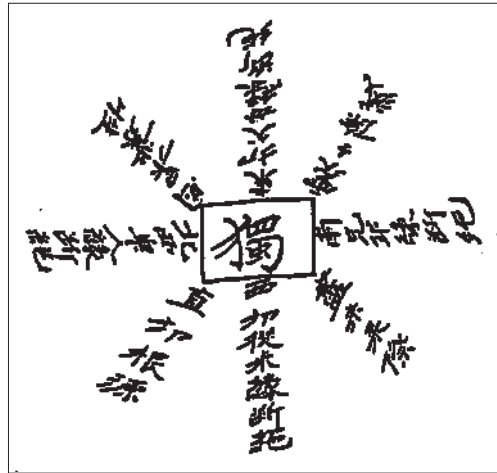
Figure 2. Special talisman for protection from deceased outcastes.

Third, the history of social discrimination in Sôtô Zen, and in Japanese Buddhism as a whole, did not begin with Tokugawa government policies. If government policies alone set the pattern for subsequent forms of social discrimination, then one might reasonably expect to find similar types of discrimination nationwide wherever Sôtô temples exist in proximity to outcaste ghettos. Instead, wide variation seems to be the rule. Likewise, even before the 1635 implementation of the temple registration system Sôtô Zen teachers already had developed special funeral rituals for people of “non-human” ( hinin 非人, i.e., outcaste) status as well as for victims of mental illness, leprosy, and other socially unaccepted diseases. Secret initiation documents, generally known as “ Hinin indô no kirikami ” (the earliest known example of which is dated 1611; see figure 1), describe the