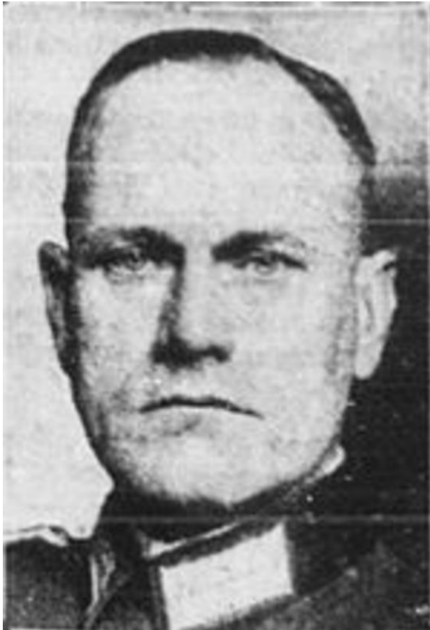
Fig. 10 - Ambassador Eugen Ott

18 The following day, on January 17, 1939: "Telegram from Dürkheim." 19 On July 14, 1942: "Telegram to Graf [Count] Dürkheim re his invitation to lunch tomorrow," 20 and on February 15, 1943: "Went to Tokyo to take lunch with Graf von Dürkheim and stayed some time with him." 21