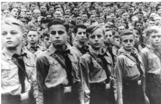
Fig. 5 - Hitlerjugend

It is for this reason that the Nazis fiercely attack Soviet Russia. They claim that the core of the Communist Party, beginning with Stalin himself, is composed of either Jews themselves or their relatives who have some connection to them and that, since people like these are up to no good, one of the great missions of the German people is to crush Soviet Russia. The speeches given by the leaders at the recent Nazi rally in Nuremberg, among others, were very extreme. They directly attacked the Soviet Union as their great enemy of the moment. They said as much as could be said in words, completely ignoring diplomatic niceties and attacking them viciously. From looking at the newspapers, you can get a good sense of their truly fierce determination. People are saying that if, in the past, the leaders of one country had done something like this it is inevitable that within twenty-four hours the other country would have declared war. In any event, the Nazis' determination is deadly serious!