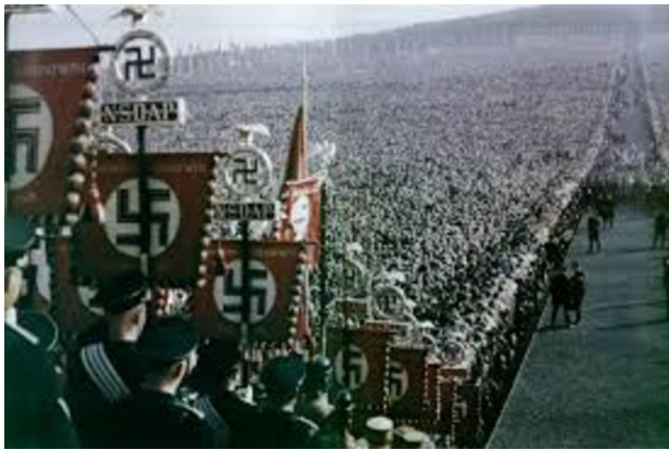
Fig. 4 - 1936 Nazi Rally in Nuremberg

On occasion, in England, too, I have encountered Jews. I recently met a young self-professed wealthy poet who had been persecuted and expelled from Germany. After listening to his story, I felt sorry for him because he suddenly found himself living in poverty in a foreign land. As regards individuals, this is truly a regrettable situation.