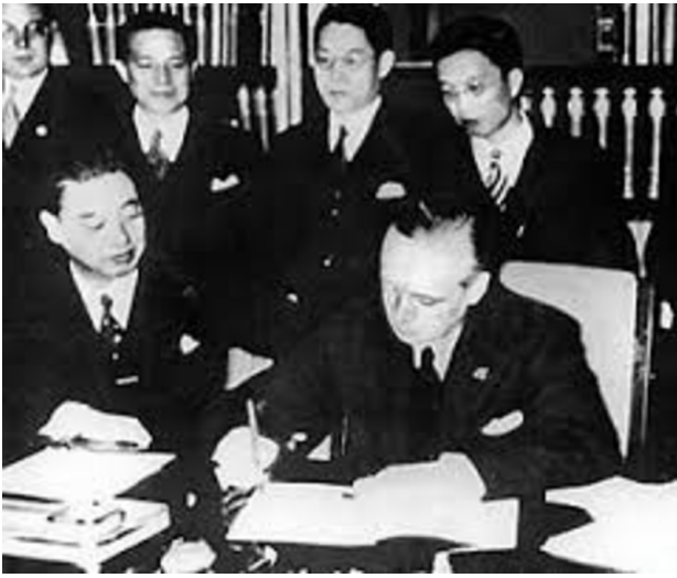
Fig. 7 - Signing of Anti-Comintern Pact

the nations not only endangers their internal peace and social well-being, but is also a menace to the peace of the world desirous of co-operating in the defense against Communist subversive activities .” 8 (Italics mine)