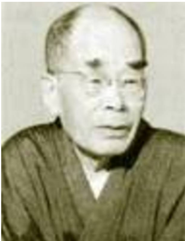
Fig. 1 - D.T. Suzuki

The always contentious, sometimes highly emotional, debate over D.T. Suzuki's relationship to Japanese fascism continues unabated. Among other things this is shown by reader reactions to a recent article in Japan Focus entitled " Zen as a Cult of Death in the Wartime Writings of D.T. Suzuki ". This debate can only intensify by the further assertion of a wartime relationship between D.T. Suzuki and the Nazis or, more precisely, a positive or sympathetic relationship between Suzuki and the Nazis. This article, in two parts, will explore that possibility though conclusive proof of such a relationship will not be included until the second part.