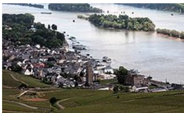
Fig. 3 - Rudesheim am Rhein

Be that as it may, Suzuki went to England in 1936 where he delivered a set of lectures that he would publish as his famous Zen Buddhism and Its Influence on Japanese Culture in 1938 (republished in the postwar era as Zen and Japanese Culture ). Following the conclusion of his lecture tour in England, he went to Paris to conduct bibliographical research, and then on to visit some distant relatives living at the time in Rudesheim am Rhein, a small village on the Rhine River west of Wiesbaden.