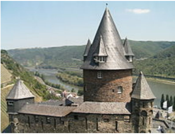
Fig. 6 - Stahleck Castle

clearly a solid structure. The interior, though plain, has been modernized and made into a well-appointed facility.