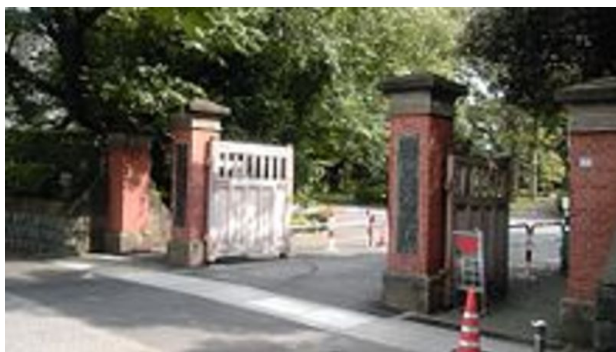
Fig. 9 – Entrance to Gakushūin

As we have seen, Suzuki was clearly opposed to Russian-style, or Soviet Communism. Yet, there is no compelling evidence to suggest he abandoned his socialist sympathies following his return to Japan in 1909. One sign that he maintained them was his support for educational reform while teaching English at Gakushūin, the ultra-conservative “peers school” for the children of Japan’s aristocratic families. Lacking evidence to the contrary, Suzuki might best be described as a “closet socialist” following his return to Japan. Yet, even if this were true, how might it help to explain a possible sympathy for the Nazis?