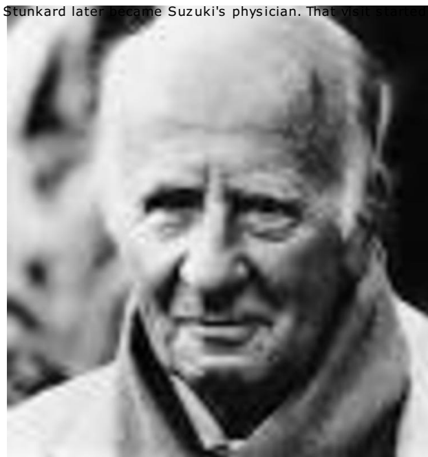
Fig. 2 - Graf Dürckheim

a chain reaction of visitors to the Suzuki residence, one of whom was Philip Kapleau, author of The Three Pillars of Zen and founder of the Rochester Zen Center. Dürckheim thus was directly responsible for launching Zen into the American mainstream. 4 (Italics mine)